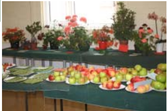
Apples and plants