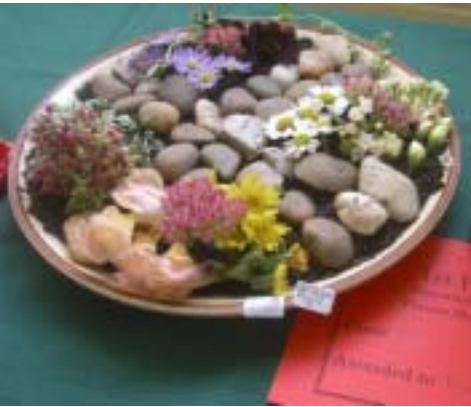
Harriet's prize winning garden on a plate