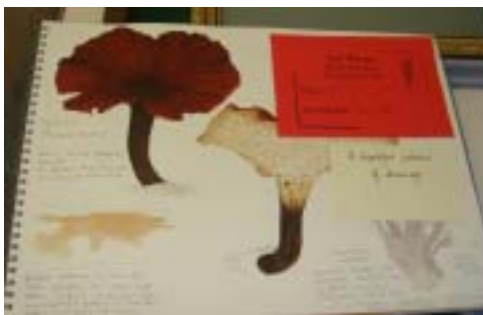
Pat Guy's stunning watercolours