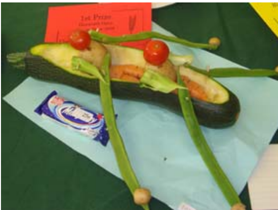
Harriet's vegetable athletes