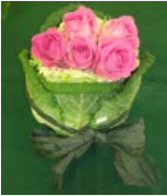
Zoe Millington's stunning 5 flowers and foliage