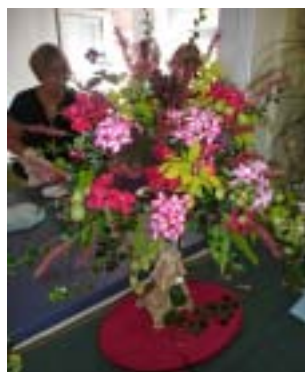
1st prize winner, arrangement with fruit