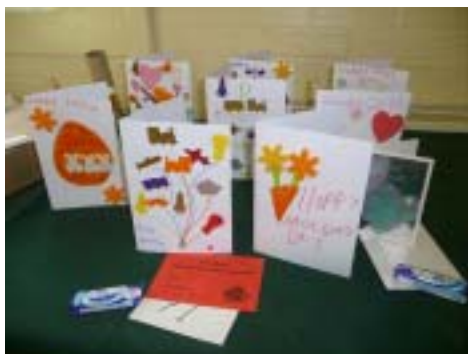
Home made greeting cards