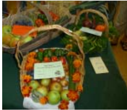
Stunning Diseworth Harvest Baskets