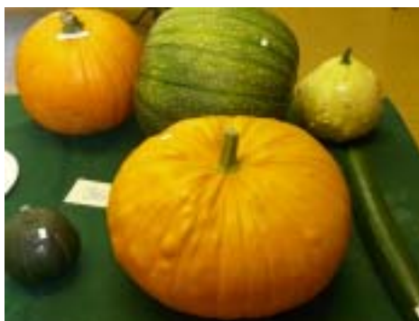
Novelty marrows and pumkins