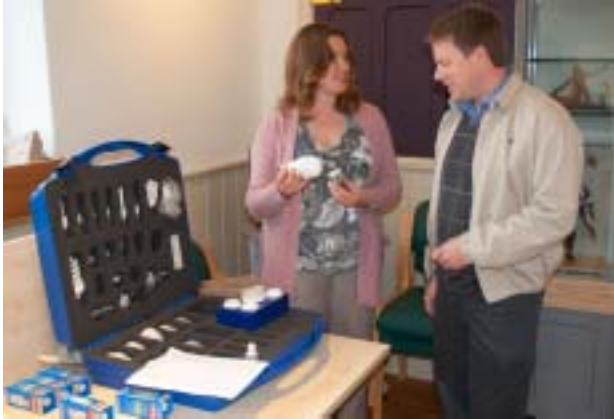
Discussing low energy light bulbs

Stands had been set up which offered advice on home insulation and many other energy saving devices. A bulb library was very popular where visitors could test the latest low energy bulbs and see which ones are the brightest and note what they all cost.