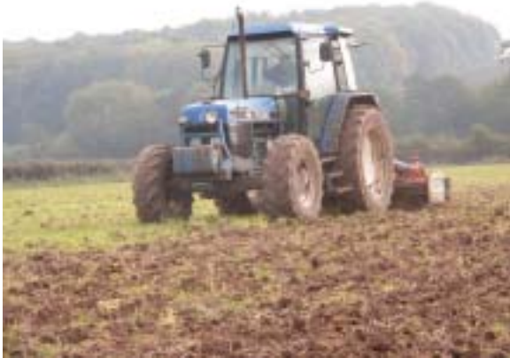
Will power harrowing his grass seedbed

Once the crops are all harvested and the straw bales gathered in, the race begins to pull up the old stubbles ready for fresh crops to go in. It has been a difficult harvest as the weather has been changeable, and as we go into autumn proper, nothing much has changed. Still looking on the bright side, Will has been able to get some ground worked up on the dry days.