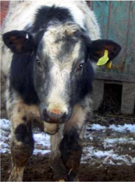
One of the Jarrom's calves with it's two ear tags

be removed before the bale can be rolled out. It is very easy for the tags to catch in this netting and be pulled out.