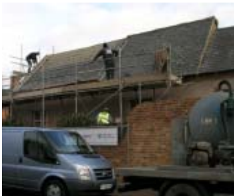
The roof goes back at last