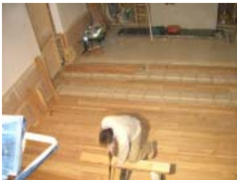
Floor from above