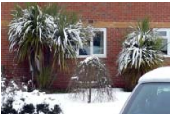
Tropical winter wonderland on The Green