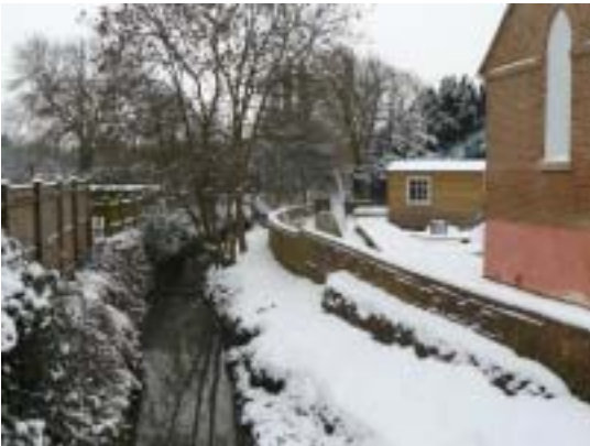
Diseworth Brook past the Heritage Centre