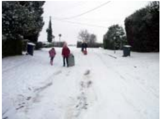
Tobogganing on The Bowley