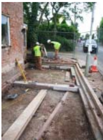
Footings for the new extension