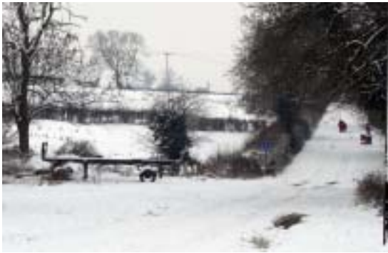
View up Long Mere Lane