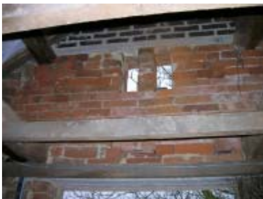
Special space for the bats