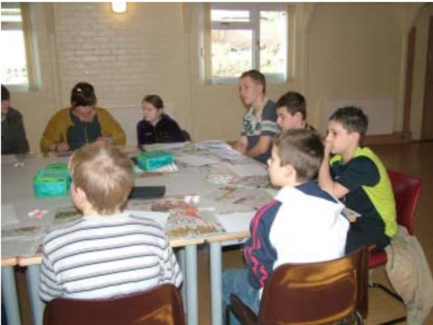
The Youth Forum meeting in Diseworth Village Hall