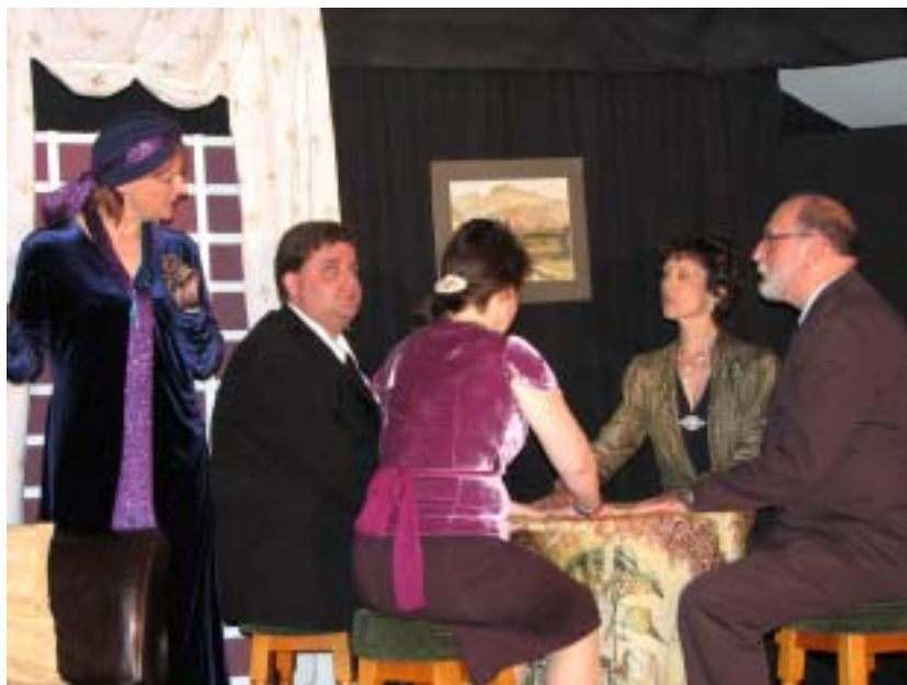
The séance. From left, Madame Arcati, Charles, Edith, Ruth and Doctor Bradman

former wife to be quiet and Ruth believed he was addressing her. Thinking that her husband was insane, it was only when Elvira began to move objects and throw flowers to the floor that she became increasingly anxious and jealous, realising that this spectre still had a hold on her husband.