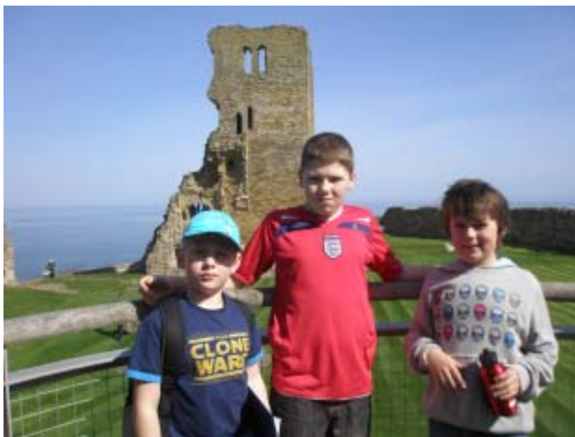
Enjoying the visit to Scarborough Castle

On the way home we stopped and walked all the way over the Humber Bridge, it took 37 minutes!