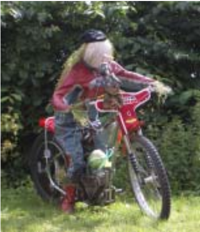
Speedway racing on The Green