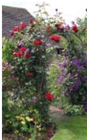
Stunning Summer colours at West View