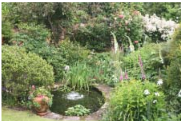
Peace & Tranquillity at 14 Lady Gate