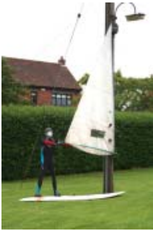
Windsurfing on Grimesgate