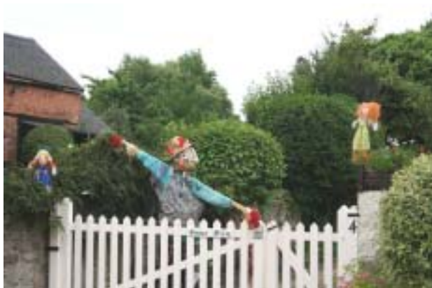
Gracedieu - Clements Gate