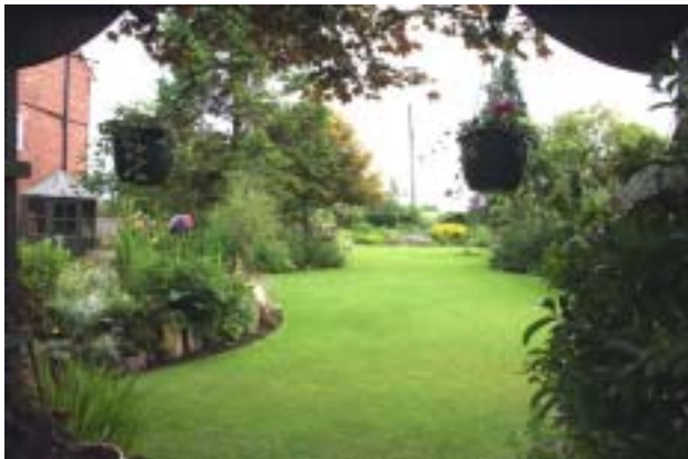
The beautiful garden at Ivy Brook Cottage