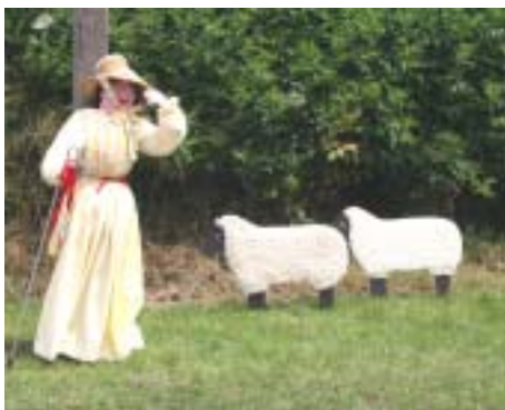
Little Bo-Peep looking for her sheep. Old Hall Farm