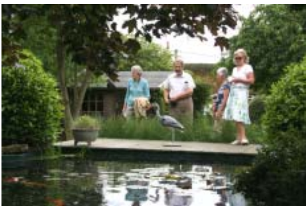
A Serene Scene at 9 Hall Gate