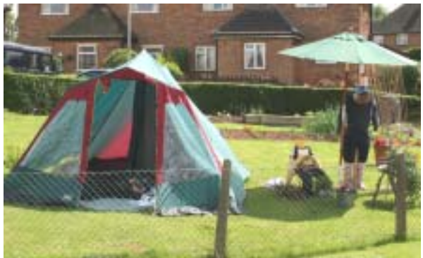
Brownies & Guides camping on The Bowley