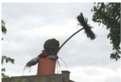
Chim chiminee! This sweep is as happy as happy can be!