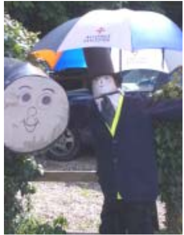
“You’re a very useful engine Thomas” said the Fat Controller