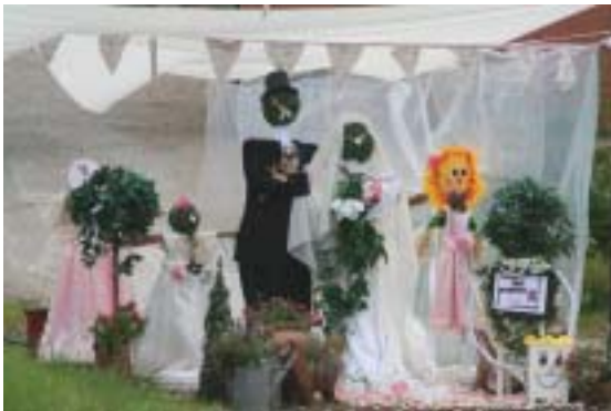
The Wedding at Linthwaite Court