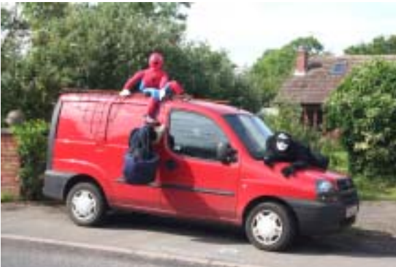
Spiderman tackles the villains at Tenterfield