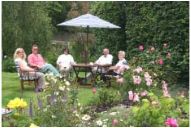
Relaxing in the sunshine at 9 Clements Gate