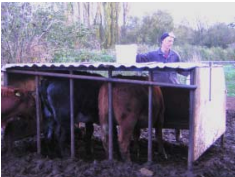
Will using the creep feeder to feed his cows and calves

As the cooler weather starts to close in and the grass stops growing, most of the cattle outside need to have supplementary feed and for most of them, it is a case of having a few bales of hay on the ground. It's not quite that simple for the group of cows with calves at foot that live in the field behind the house. The calves were all born in the field during the spring and summer, and while the weather was warm and the days long, there was lots of grass for the cows and eventually the calves when they started to graze.