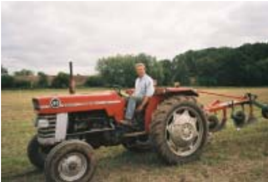
The Ploughing Match. One of the competitors