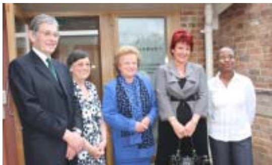
Grand Opening of the Heritage Centre