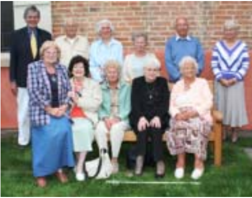
Unveiling of the Retired Residents Bench in the Sanctuary Garden at the Heritage Centre