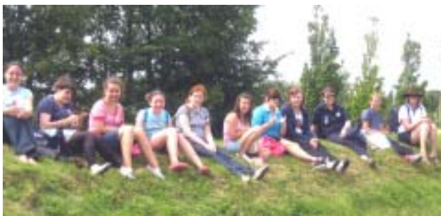
1st Diseworth Guides enjoying their weekend away