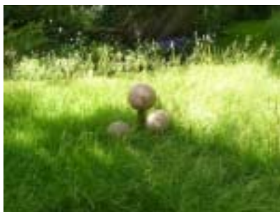
Meg and Paul's beautiful garden