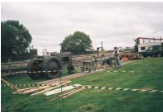
Woodcutting at the Diseworth Working Day