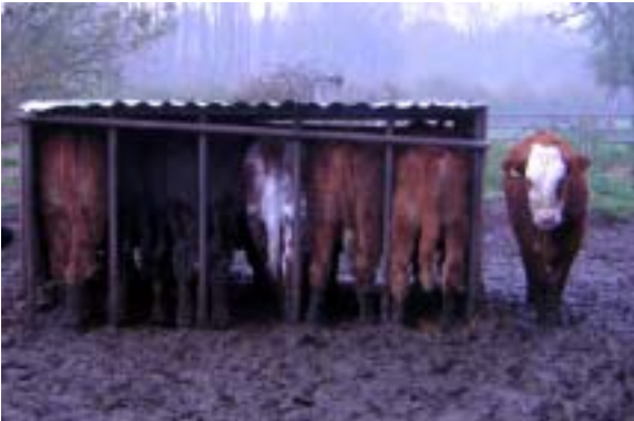
Beautifully posed. Cattle from Ladygate Farm at the creep feeder

Guides and Brownies at the Service of Remembrance, Diseworth Church