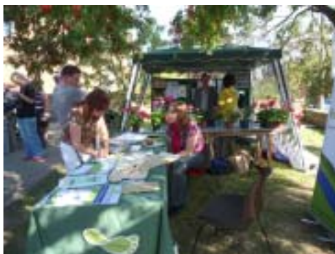
Annual Flower Show