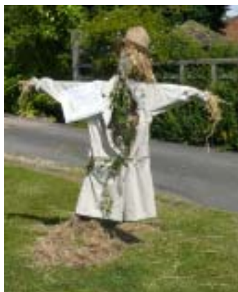
The original scarecrow