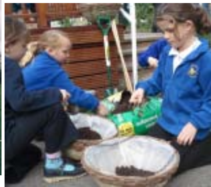
Bulb planting, Diseworth School