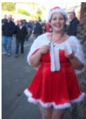
Dressed for the Boxing Day Fun Run!